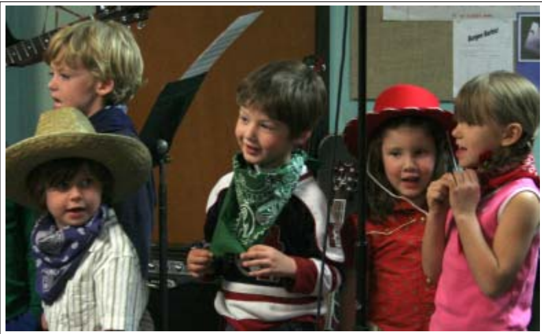
Just a few of the great singers and performers at Project Sharing Night

We're having an Open House this Sunday, from 2 o'clock until 4 o'clock, to give prospective students and their families an opportunity to see the school and talk to teachers. If you know anyone who would like to learn more about Kino, please pass the word.